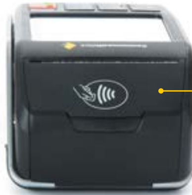
Printer Compartment Lid